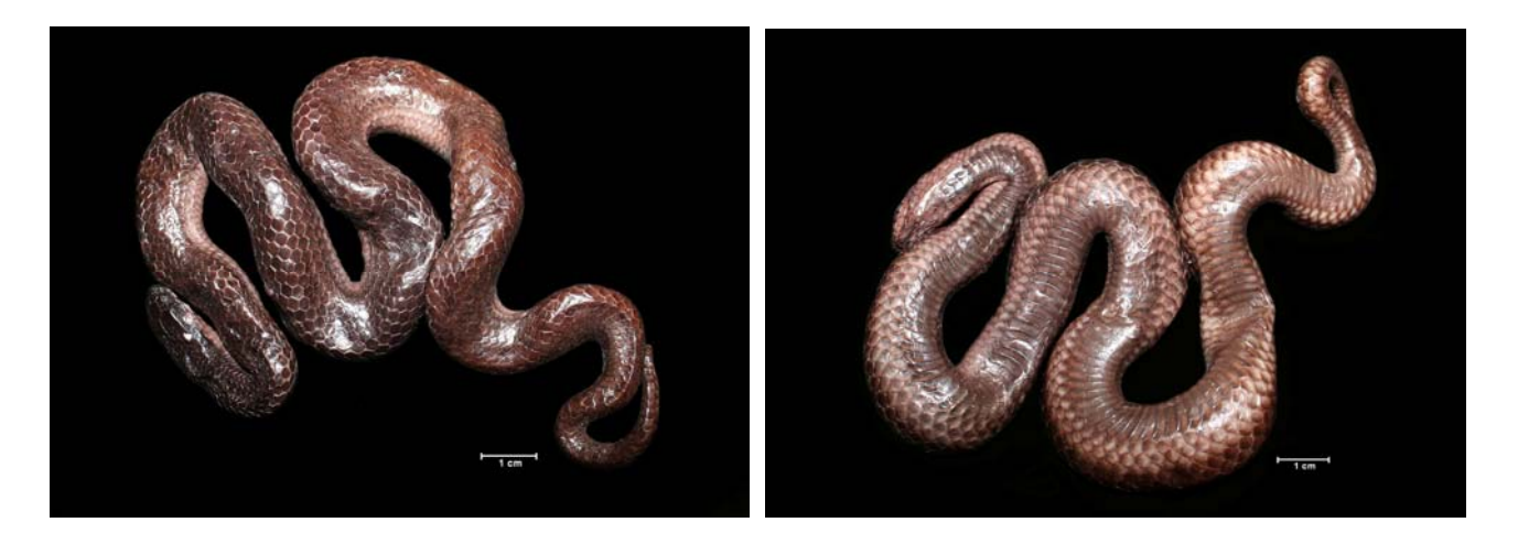
Figure 1: Dorsal and Ventral views of the specimen